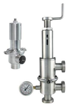
CO2 Pressure Relief Valve