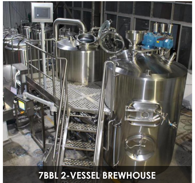
7BBL 2-VESSEL BREWHOUSE

Three vessel brewhouse will have higher brewing efficiency, with optional steam and electric heating, which can brew four batch beers per day. Usually applying to middle micro breweries.