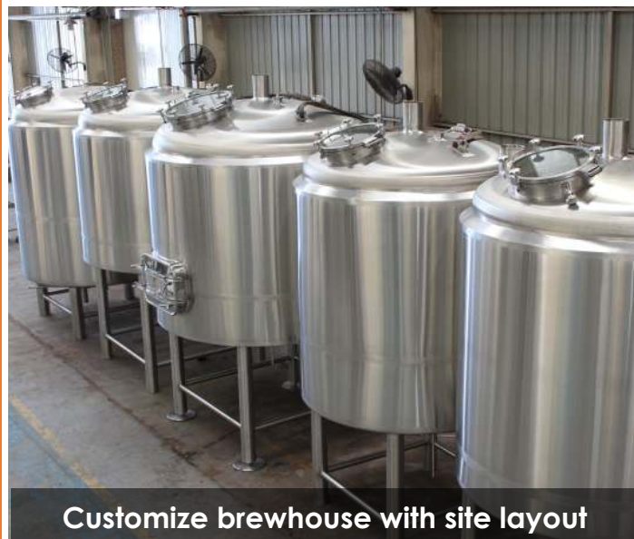
Customize brewhouse with site layout