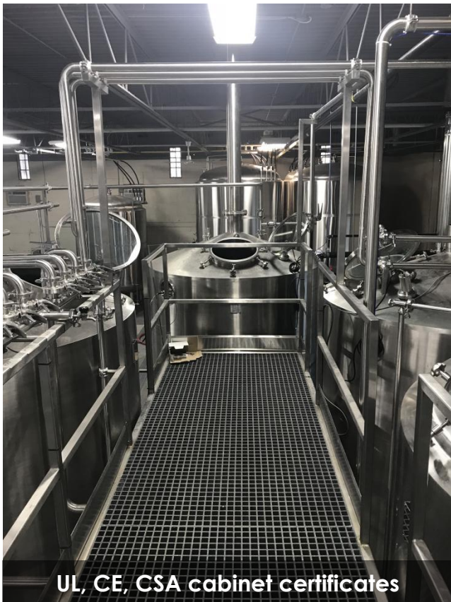
UL, CE, CSA cabinet certificates